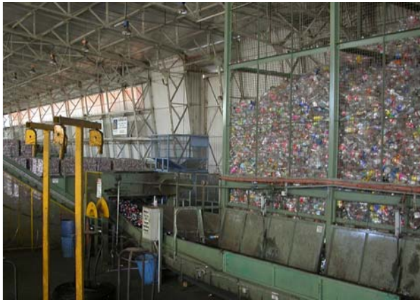
Clear and coloured PET is stored in different silos