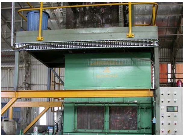
The baler crushes cans, bottles and cartons