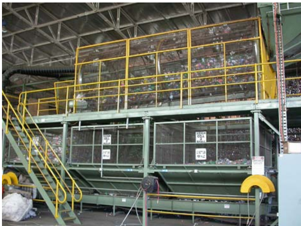
PET bottles are sorted by size, then weighed