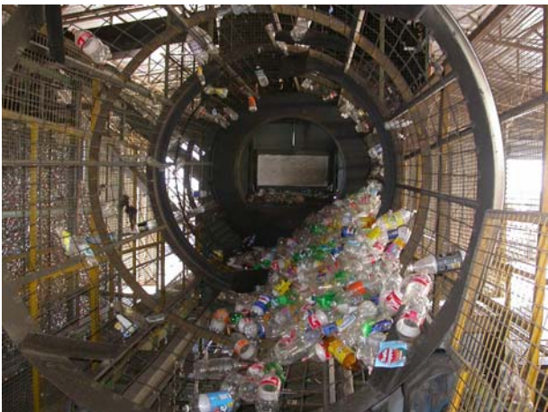
PET bottles tumble through the trommel