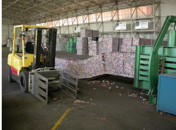
Bales are stored in the factory, ready for transport