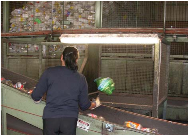
Coloured bottles are separated by hand