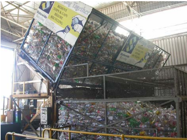
Bottles and cans arrive from collection depots